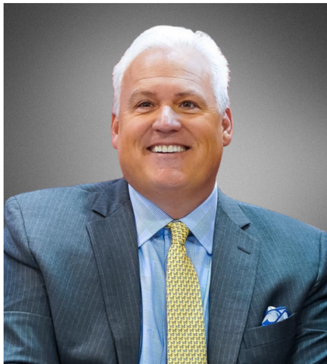
MATT SCHLAPP CHAIRMAN, CPAC

The CPAC Foundation's Center for Legislative Accountability is proud to present our Ratings of the States. Like our Ratings of Congress, CPAC's Foundation's Ratings of the States are meant to reflect how elected officials view the role of government in an individual's life. We begin with our philosophy (conservatism is the political philosophy that sovereignty resides in the person) and then apply the proper role of government (its essential role is to defend Life, Liberty and Property).