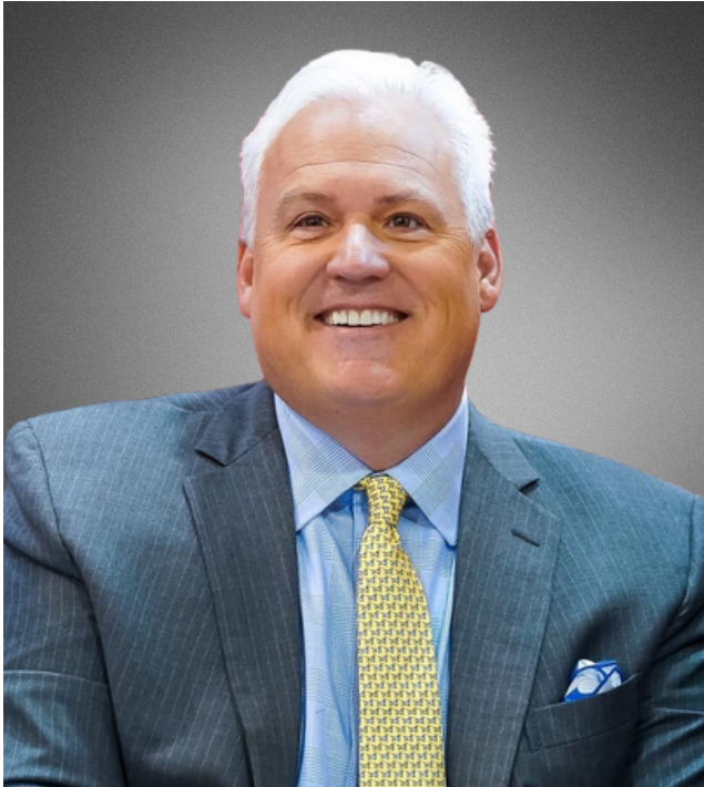
MATT SCHLAPP CHAIRMAN, CPAC

The CPAC Foundation's Center for Legislative Accountability is proud to present our Ratings of the States. Like our Ratings of Congress, CPAC's Foundation's Ratings of the States are meant to reflect how elected officials view the role of government in an individual's life. We begin with our philosophy (conservatism is the political philosophy that sovereignty resides in the person) and then apply the proper role of government (its essential role is to defend Life, Liberty and Property).